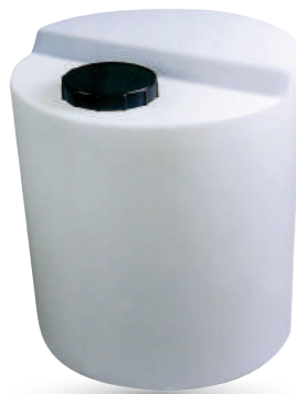
Polyethylene tanks SER Series